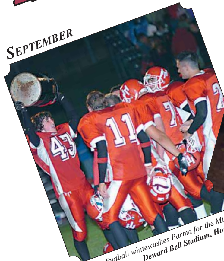
SEPTEMBER Homedale football whitewashes Parma for the Milk Jug at Deward Bell Stadium, Homedale